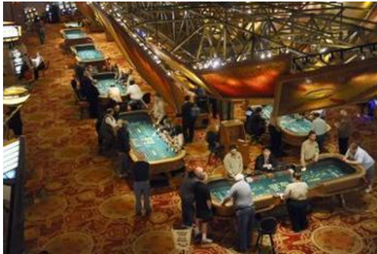
Patrons play craps at tables at Mohegan Sun in Uncasville, Conn.